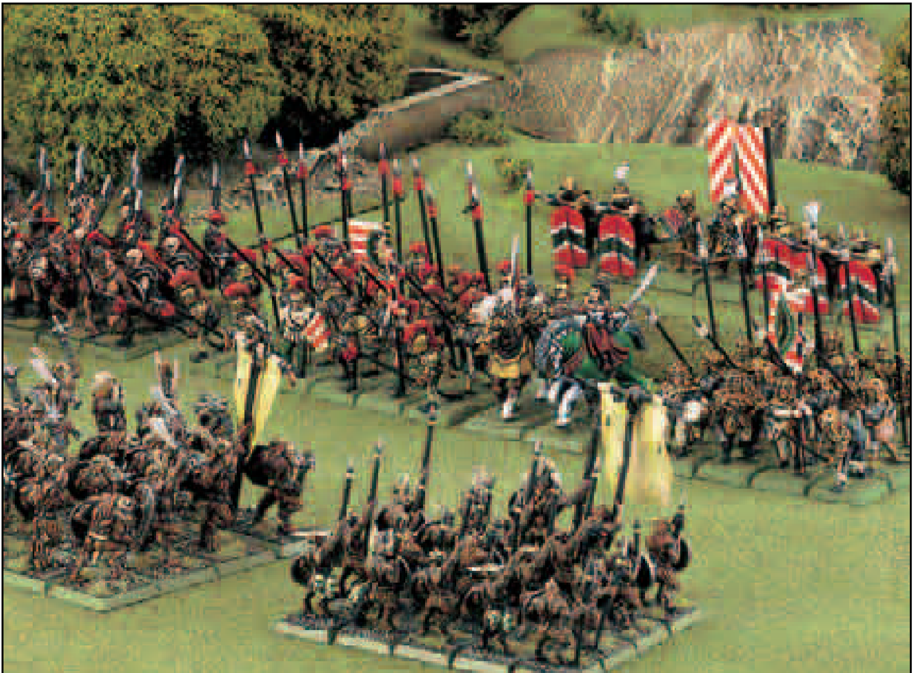
General Enzo's Dogs of War army prepares to fight off a ferocious Beastman warband.

Special Rules: Treat as a stone thrower from the rulebook (page 120) with the following changes. The Hot Pot has a maximum range of 36". Hits are resolved at S3, with no armour save allowed. The model under the hole of the template suffers a Strength 6 hit, with no Armour save allowed, which causes D3 wounds.